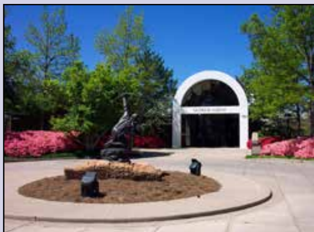
Gilcrease Museum houses the world's largest and most comprehensive collection of art and artifacts of the American West.